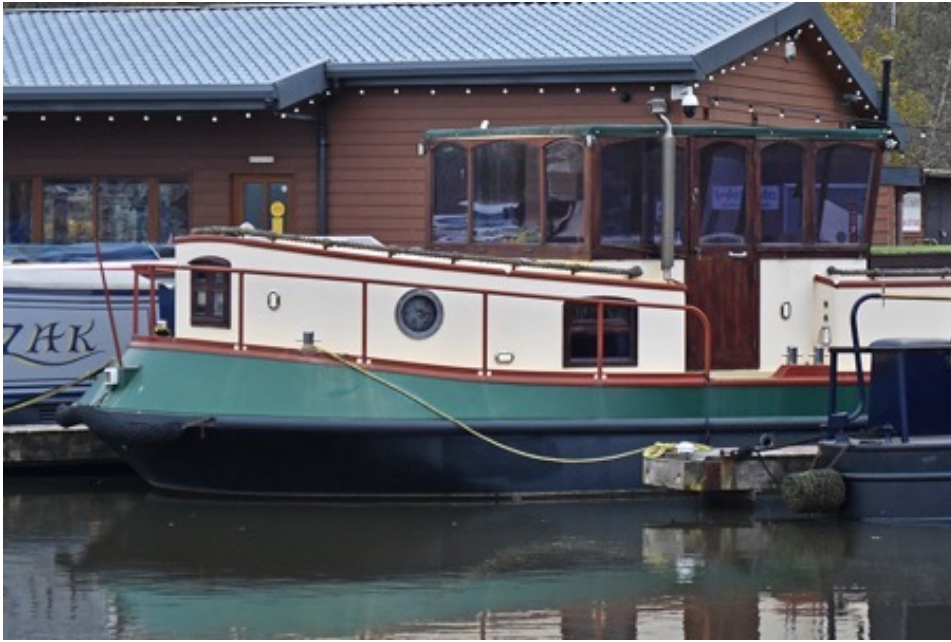
Rear deck with guard rail.